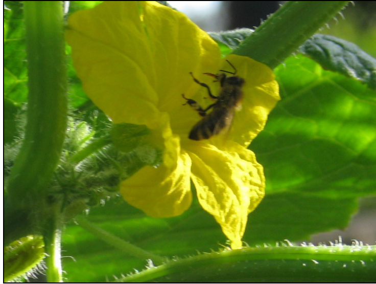
Bee pollinating flower of cucumber

Last year's decline in local bee populations rightly received wide publicity. Falling bee numbers is a lose-lose situation for everyone (except, of course, for those allergic to bee stings!). The honeybee not only produces honey and beeswax but, even more important, it is the pollinating agent of many flowering plants.